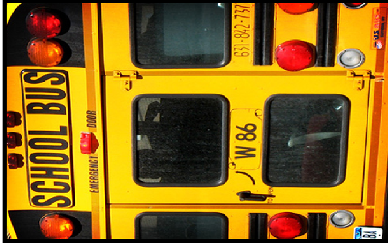
Marian Baker School

San Ramón de Tres Ríos San José, Costa Rica Phone: 506-2273-0024 Fax: 506-2273-4609